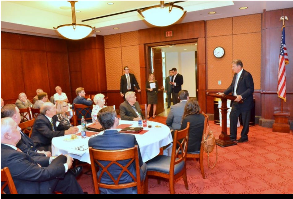
West Virginia U.S. Senator Joe Manchin addresses League Hike the Hill participants on September 20, 2017 during a luncheon at the U.S. Capitol Visitors' Center.

been introduced in both the House and Senate.